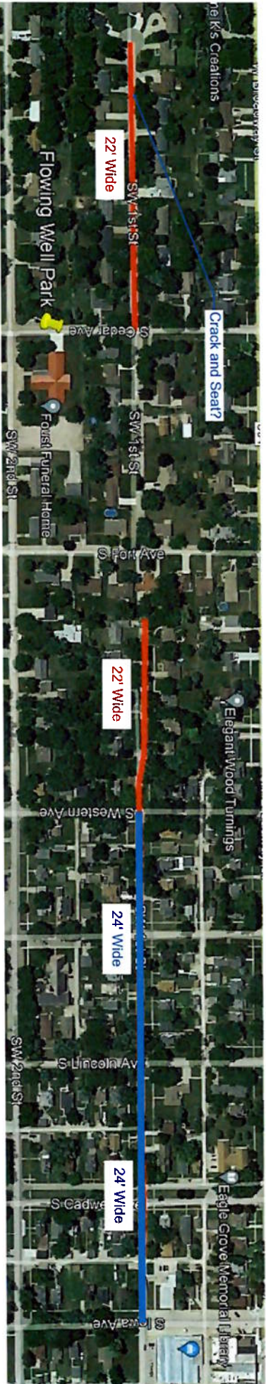
SW 1st Street - South Cedar to Cui de Sac