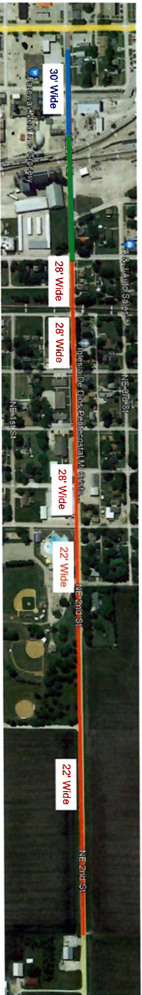
NE 2nd Street - North Commercial Avenue to East City Limits (Substation)