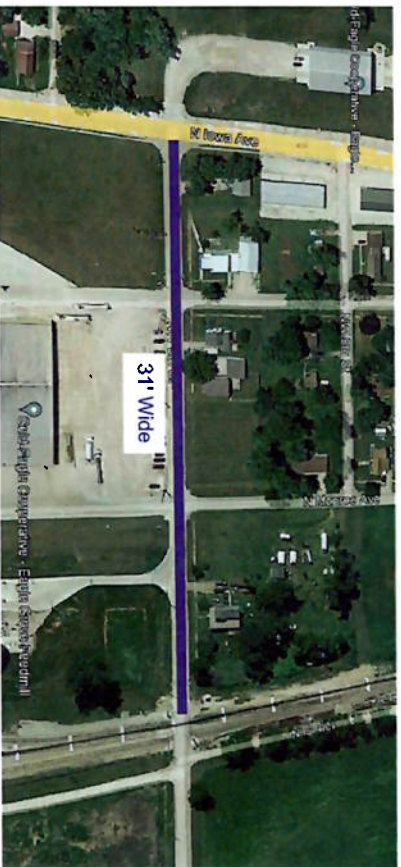
NW 8th Street - Hwy 17 to Railroad Tracks